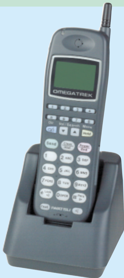
Omegatrek PS6 Portable Station