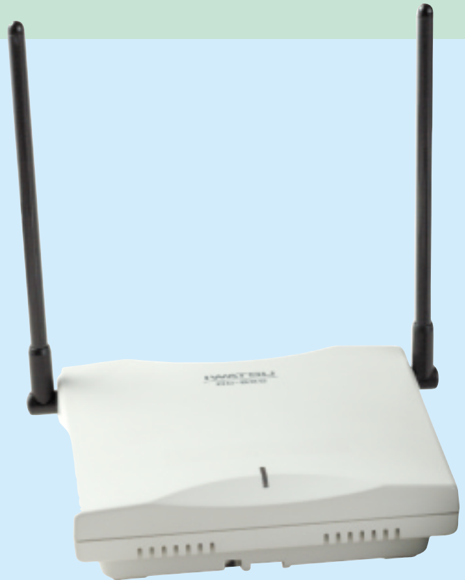
Omegatrek IX-BS5 Base Station

IWATSU TOOLS THAT EVOLVE FASTER THAN YOUR BUSINESS