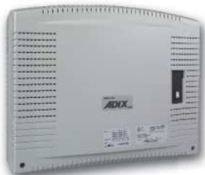
ADIX-VS Cabinet (VS-KSU)

Integrated Omega-Voice VMI will take your business communications to the next level with flexible, productivity-enhancing voice mail capabilities. With up to four voice mail ports, 50 mailboxes, and eight hours of message storage, Omega-Voice VMI provides your company with the call processing power necessary to meet business demands. Along with standard mailbox features, advanced features optimize voice mail with capabilities such as simultaneously broadcasting messages to multiple extensions and monitoring voice mail messages as they are recording.